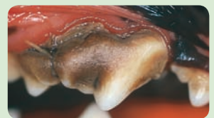
Figure 3: Periodontitis with very inflamed and receding gums