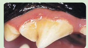
Figure 2: Gingivitis with early calculus