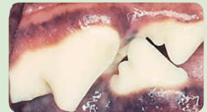
Figure 1: Healthy mouth